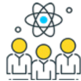
Training & Development Modules