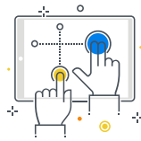
Marketing & Promotional Tools