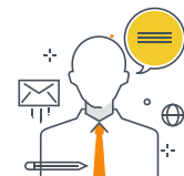
30+ AR/VR Consultants