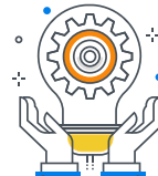
Industry Use Case Expertise