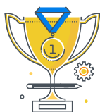
Award-Winning AR/VR Projects

Delivering Surreal Experiences with our Award-winning AR/VR Capabilities