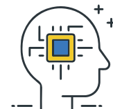
Advanced Automated Proctoring